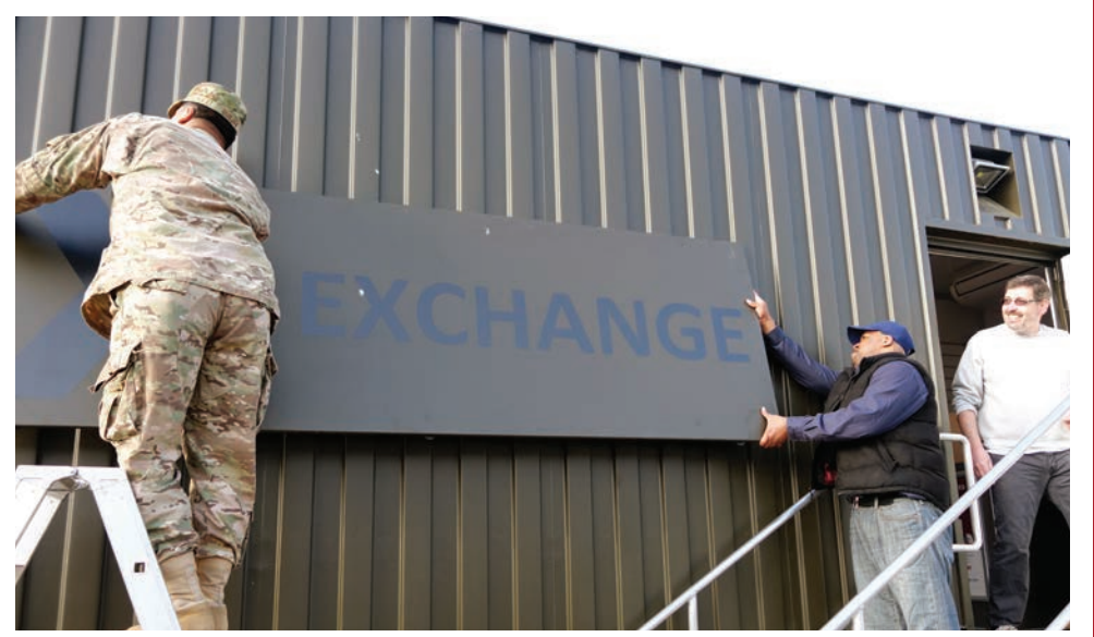
A Soldier and Exchange associate attach the Exchange sign to a mobile field exchange serving American troops on military exercises in Poland.