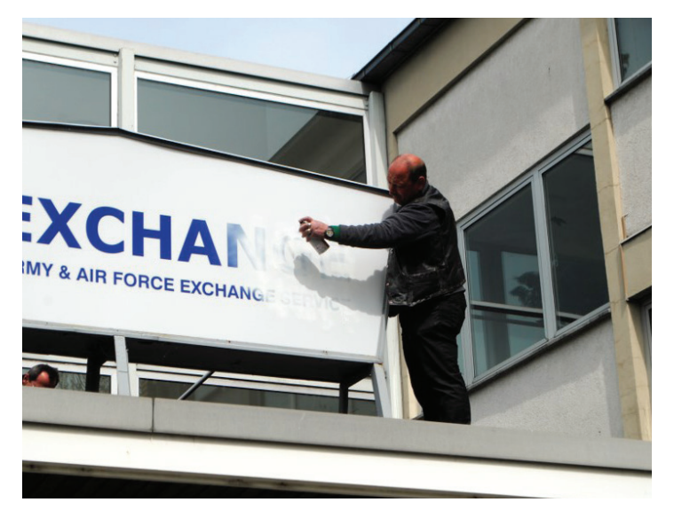
The DC sign is painted over as the warehouse is closed.