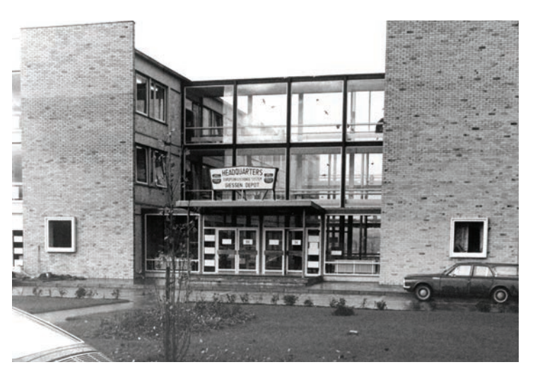
A photo of the Giessen Distribution Center from the early 1960s.

In February 2017, Exchange managers from the Dallas HQ and Europe celebrated the <u>grand opening</u> of the Germersheim Distribution Center and boxed up Giessen's memories for the Exchange history archives. X