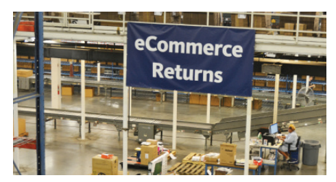
The eCommerce return area at the Dan Daniel Distribution Center.

"Once the distribution center receives the package, the item is evaluated by a DC return associate