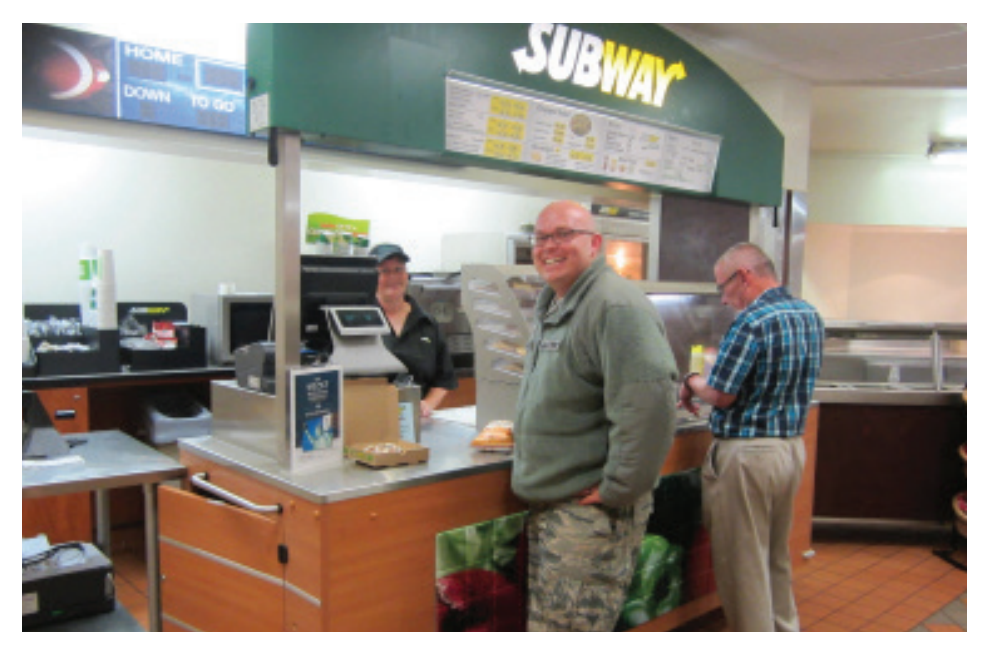
Cheyenne Mountain Air Force Station customers enjoy lunch at the Exchange Subway cart.

Another interesting fact about the facility—it features the only cashier-less, micro-market kiosk at the Exchange. The kiosk is fully integrated with the Exchange warehouse and inventory through a proprietary system, OneMarket. This channel of information keeps the market stocked with customers' favorite products using sales to track top selections and make adjustments to the product mix. Customers can scan the item and pay with a credit card to make purchases. X