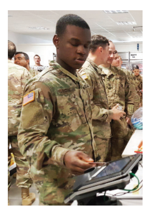
The grand opening in Zagan, Poland. Read more about support of military exercises in the Pacific and Europe/SWA on pages 10-11.