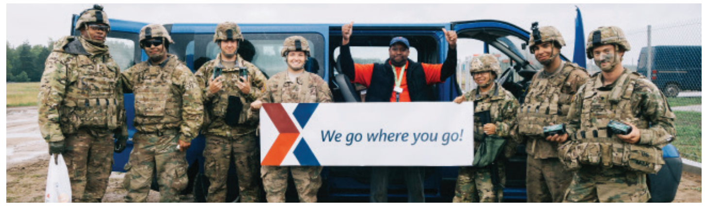
The Exchange supported Anakonda 16 in Poland.