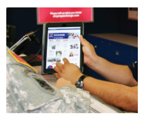
Creating a seamless shopping experience is eCommerces's goal.

The eCommerce/customer experience team consists of the e-commerce store functions and the omni-channel marketing functions for the Exchange. It is paramount for customers to have the same seamless and frictionless experience no matter how they choose to shop—brick and mortar, website or mobile.