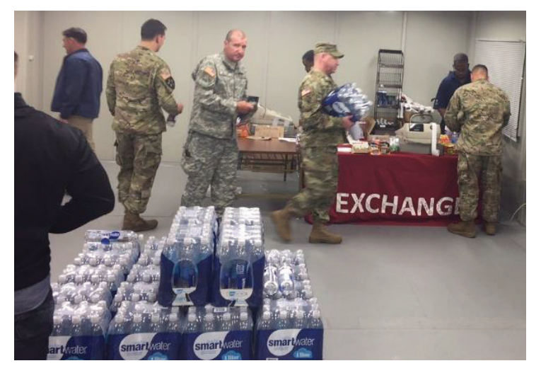
The Camp Zama Exchange team set up an off-site mini Express at the Yokohama North Dock in Japan.