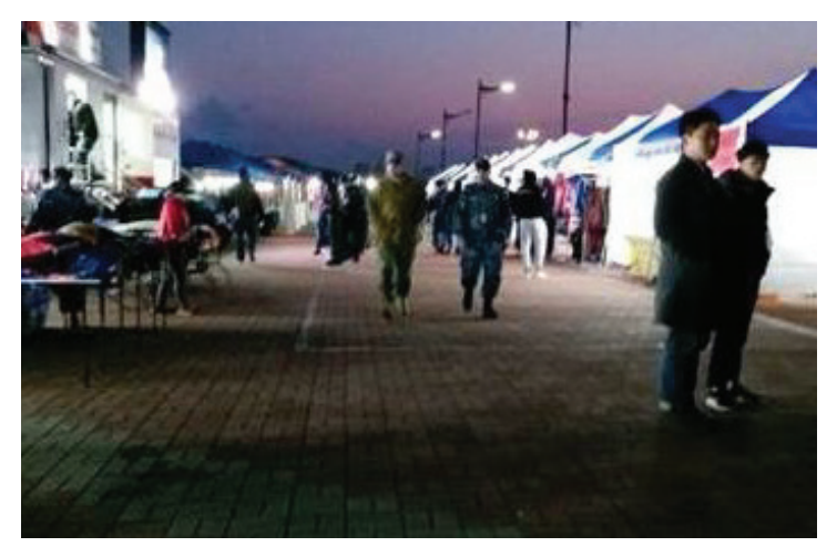
The Exchange bazaar hours extended into the night to ensure Sailors from the USS Carl Vincent Strike Group were served.