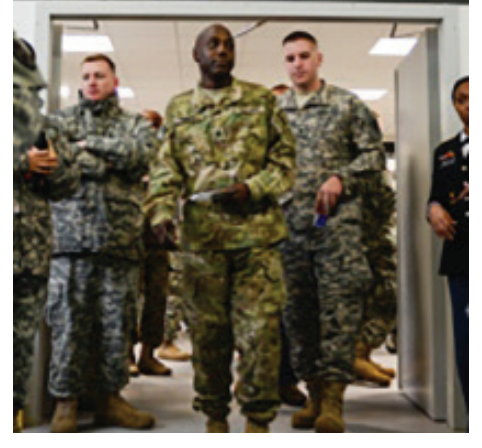
The Exchange supports our Nation's warriors while in service and after.